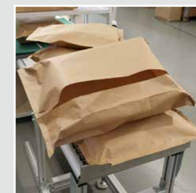
Optionally reclosable tear up perforation.